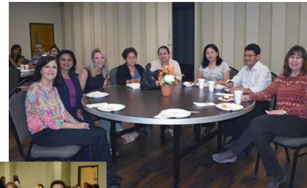
ESL Spring Luncheon