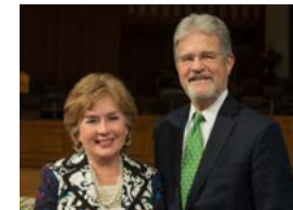
Dr. Tom & Carolyn Coburn, by letter